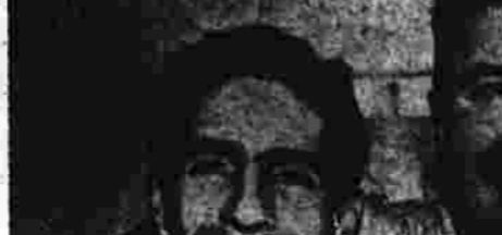
Yankee players in their dressing room after their major role in the New York Yankees 15-1 triumphing of the New York Giants in the fifth world series game.

Yankees, Giants Tied 1 to 1 in Fifth Inning